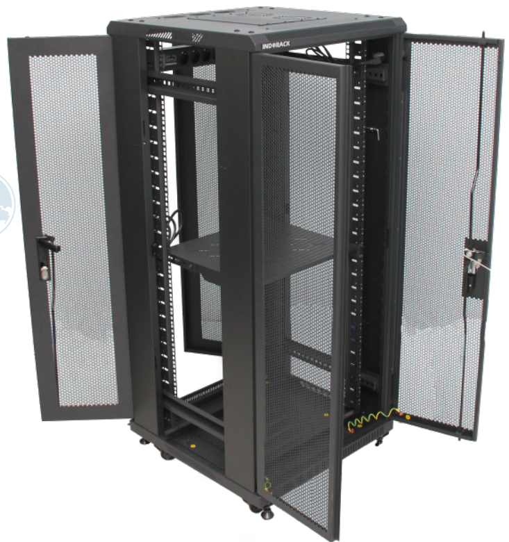
Open Side View

Optional cable entry on top cover and bottom panel. Front door, rear door and side panel can be removed facility, the bottom has the function of ventilation and rat-proof. Varies optional accessories, reliable quality.